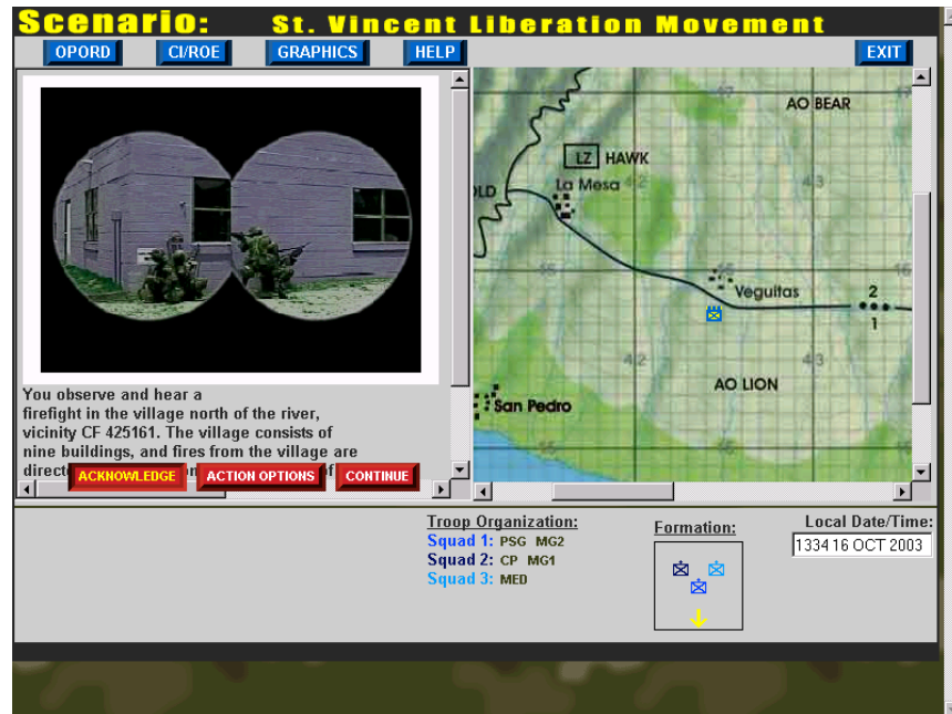
Figure 4. Sample program screen from SA Trainer module of ISAT Program.

based training programs as a tool to enhance development of the skills necessary to gain and maintain the higher levels of SA that provide the foundation for decision making and action.